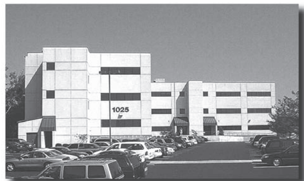
Department of Financial Institutions’ location at 1025 Capital Center Drive.

The Department of Financial Institutions is one of 13 agencies within the Cabinet for Public Protection and Regulation and is totally self-funded. Revenues are derived from fees charged for assessments, examinations, call reports, applications, investigations, registrations, and licensing of state-chartered financial institutions and securities offerings and entities.