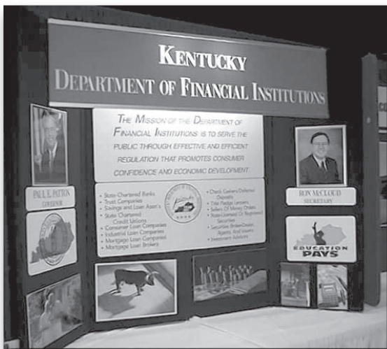
One of the department's consumer information displays.

Staff members from throughout the agency continued to enhance the agency's visibility by participating in public education forums, town meetings, and industry association meetings. The Department's presence at career days and job fairs was further increased during 2002 as Administrative Services staff visited high schools and colleges in Kentucky and spoke with students about job opportunities. Administrative Services employees also represented DFI at the annual Governor's Diversity Day, a job fair that draws hundreds of students and teachers from across the state to Frankfort to learn about career opportunities in state government.