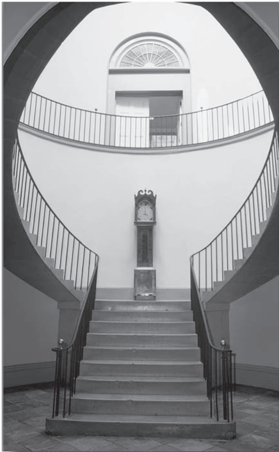
The old Capitol.