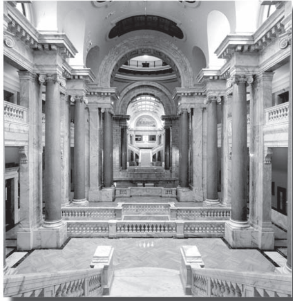
The Capitol-view from the House of Representatives.

Although DFI has had an on-going strategic planning program for several years, Senate Bill 239 introduced this managerial tool at the cabinet level throughout state government. Each cabinet is directed to submit a four-year strategic plan to the